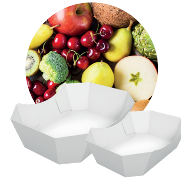
FRUIT AND VEGETABLE PACKAGING